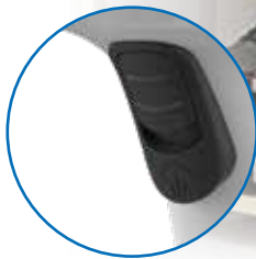
Steam Lock Switch