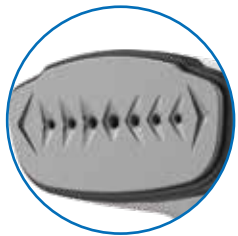
Stainless steel coating