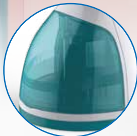
260ml Water Tank