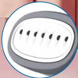
Stainless steel coating