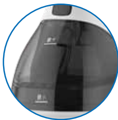
300ml Water Tank