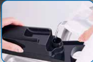
450ml Water Tank Capacity