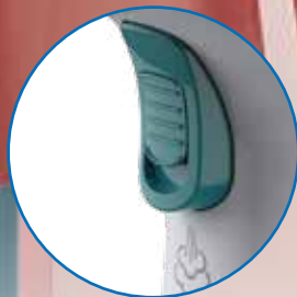
Steam Lock Switch